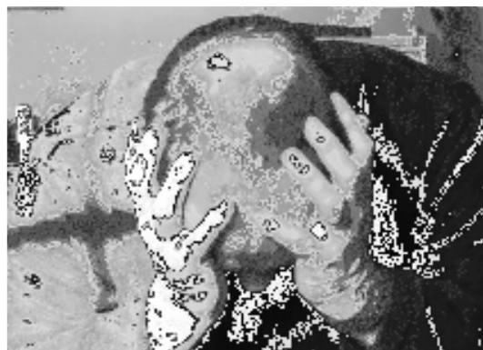
'How will they manage without me?'

This leaves four situations vacant: four exciting opportunities... why not get involved and do something for your League? It's rewarding!